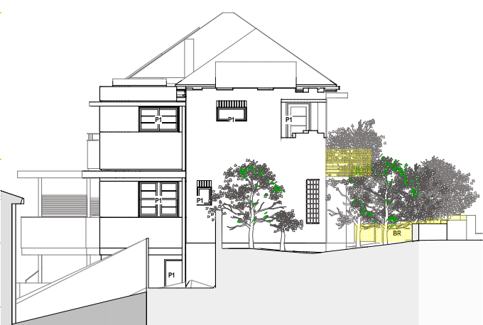
2 PROPOSED NORTH ELEVATION 1:200 DA2.01