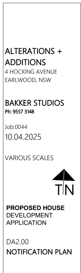
No part of this drawing may be altered or reproduced without permission of Bakker Studios